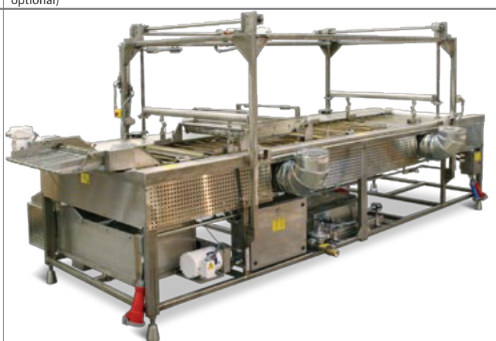
14 ft. fryer, holds 6 donuts per pocket, with conveyor hoist standard. 14 ft. gas only fryer, holding 8 donuts per pocket, with conveyor Century C14-24