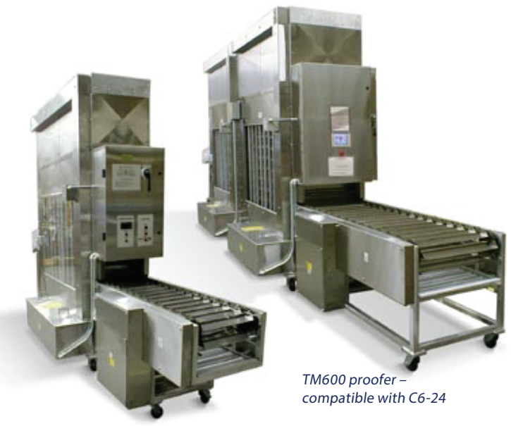
TMaco pootery agmpatible

put flour on the proofer trays. Donuts are transferred cleanly using Belshaw's active release system. The Dustless Option improves quality and saves money, by extending shortening life and reducing cleaning labor.