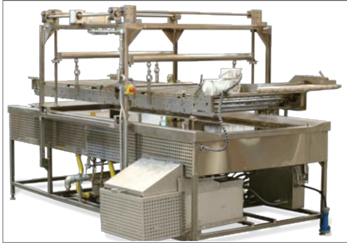
Century C10-36 — 10 ft. fryer, with 36" width for 8 donuts per pocket. Gas only with conveyor hoist standard. All models C10-24 and higher (gas and electric) incorporate this same overall design.