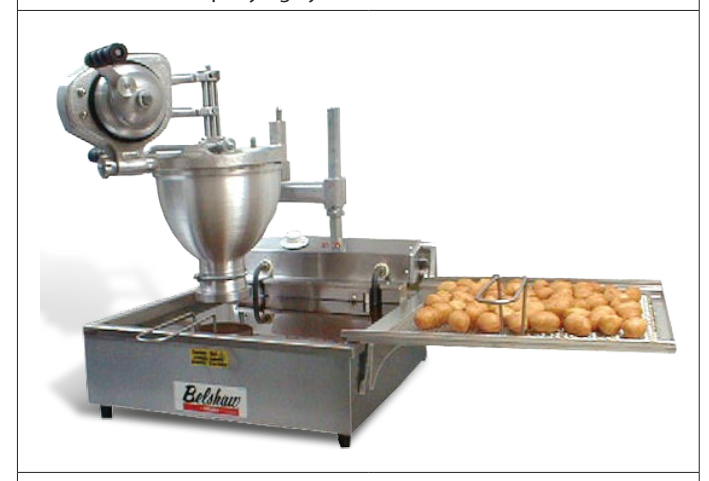
CUT-N-FRY for LoukoumadesTabletop Frying System