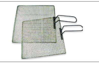
616-0512 Frying Screen (2 shown). Screen handle requires 4" (10cm) of vertical space if placed on a rack