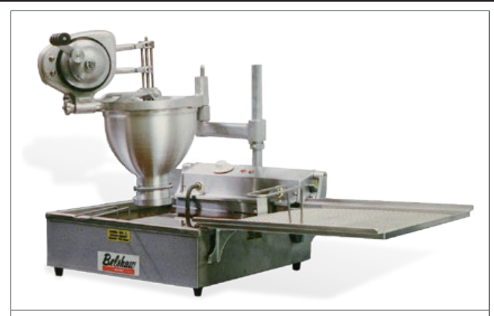
CUT-N-FRY Tabletop Frying System