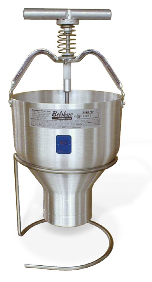
Type K Donut Depositor with Holder (Item #K-1016WSS)