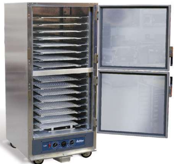
↑ Belshaw CP1/CP2 Cabinet Proofer (shown with donut firing screens)