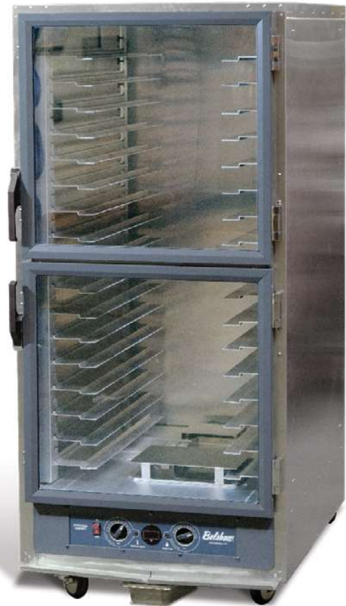
↑ Belshaw CP1/CP2 Cabinet Proofer