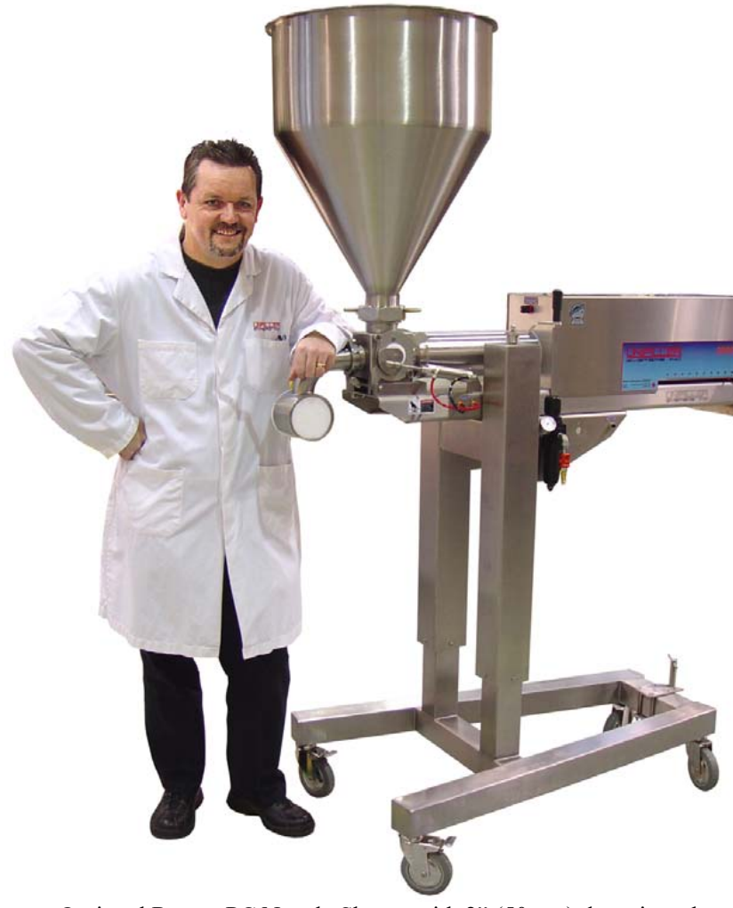
Optional Rotary PC Nozzle Shown with 2" (50mm) deposit outlet