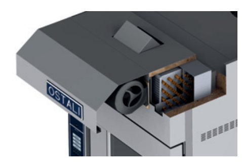
Steam condensing device, wholly integrated in the oven, with exhaust hood, without steam discharge pipes •