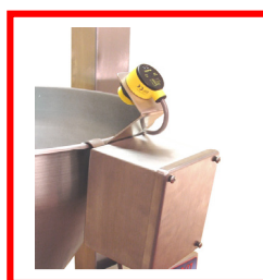
Monitors product level in hopper