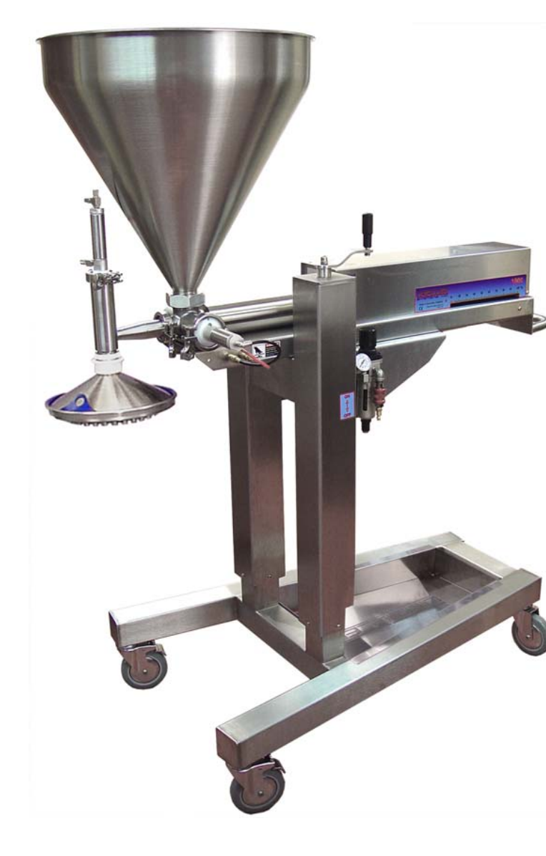
Optional cream cover head shown in photo not included.