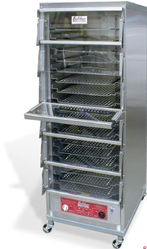
Belshaw EP18-24 Proofer

Cleaning is made easy with removable shelves and doors and a slide in-and-out electrical compartment. All components are heavy duty for commercial use. EP proofers require no plumbing, hard wiring or special installation.