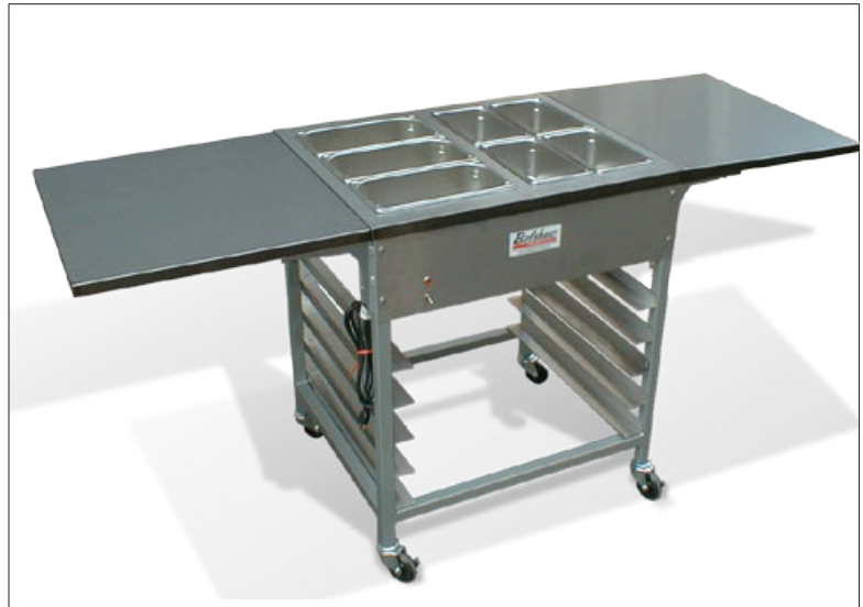
DFC Donut Finishing Center