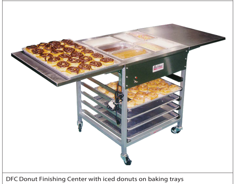
DFC Donut Finishing Center with iced donuts on baking trays