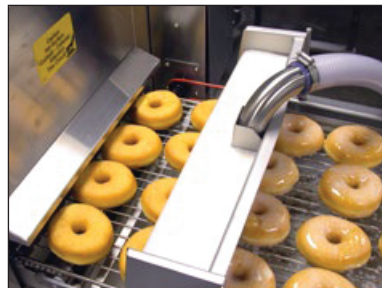
TG50 glazer in operation