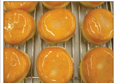
Filled donuts after glazing on TG50