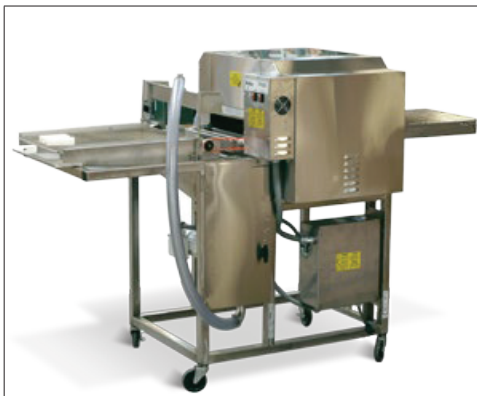
TG50 (rear view)