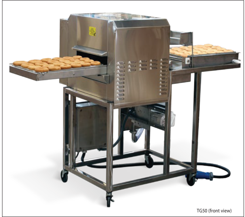
TG50 (front view)

Glaze is pumped up to a dispenser which coats each donut with a 1/8" thick curtain of glaze as they pass through. For iced donuts, the flow of glaze is turned off, and donuts can be iced on a Belshaw H&I-2 or H&I-4 icer.