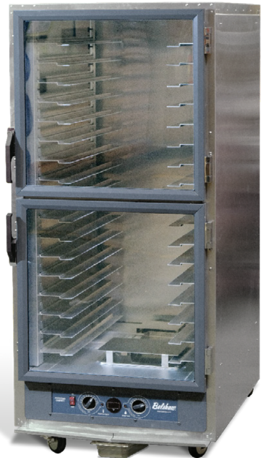
↑ Belshaw CP1/CP2 Cabinet Proofer