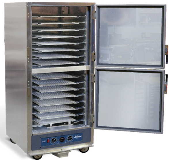
↑ Belshaw CP1/CP2 Cabinet Proofer (shown with donut firing screens)