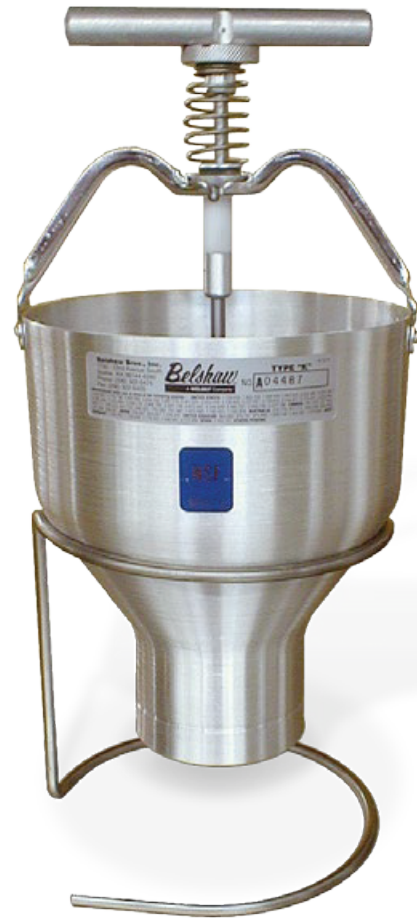
Type K Donut Depositor with Holder (Item #K-1016WSS)